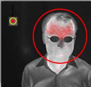
Multi Target Auto Tracking System