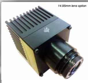
MIRICLE FevIR Scan 110K Thermal Imaging Camera