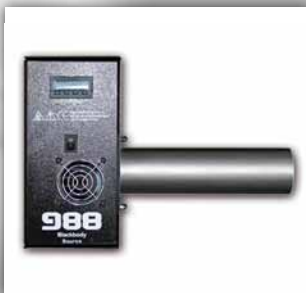
High Accuracy Infrared Thermal Calibration Source