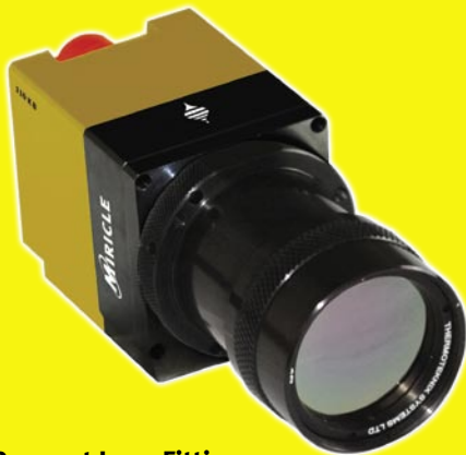
KB Bayonet Lens Fitting