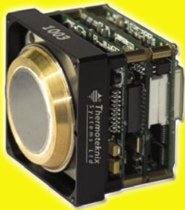
MIRICLE Camera Core